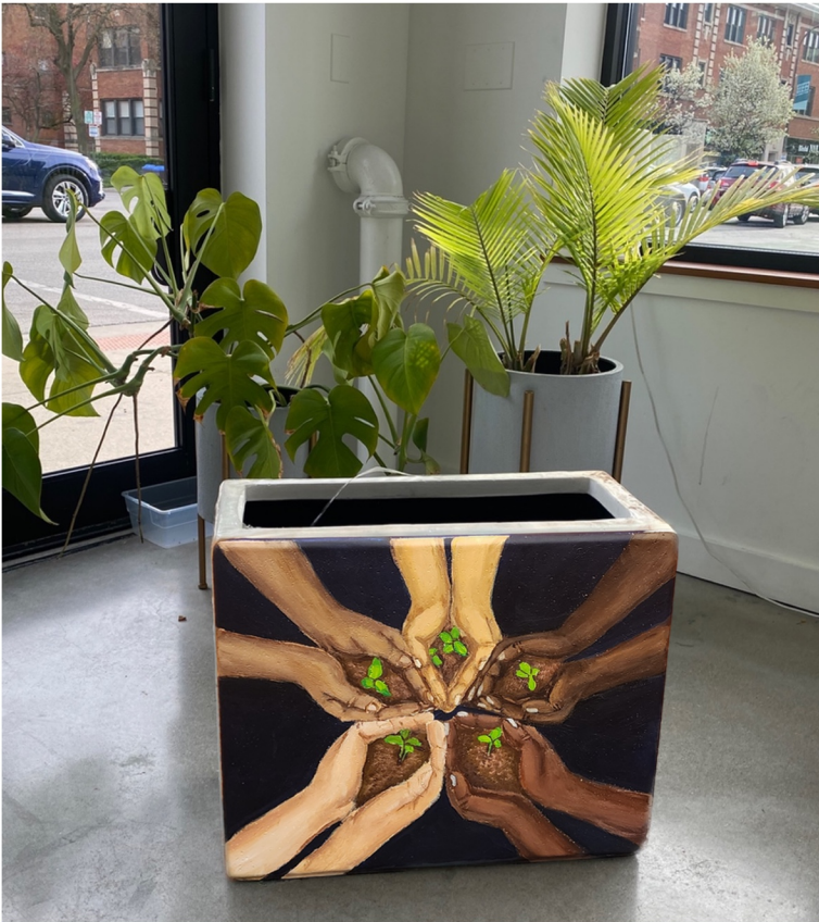
Planter sample on display at One River School, 1033 Davis St., Evanston