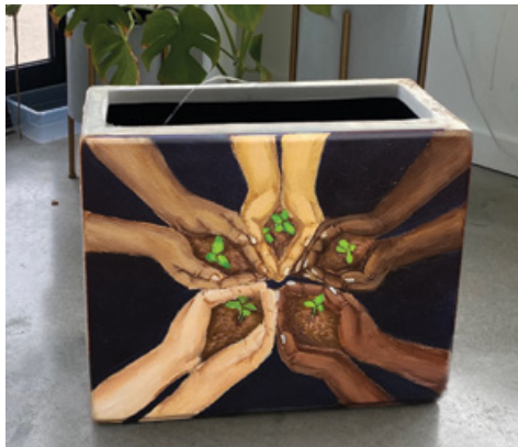
An example of planter boxes being placed throughout Evanston.

To give residents a tangible sense of the “Seeds of Change” theme and showcase it for the community, local businesses are sponsoring planters that are decorated by local artists, students and community groups and distributed around the city.